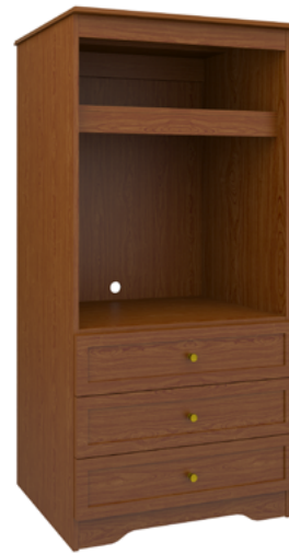
Model: LAAMTV30 35.5W 25.75D 72.25H

The Lancaster Collection offers unobtrusive refinement and skilled craftsmanship to form the perfect balance between function and beauty. Rich OG detailing on the tops and recessed insert panels set into chamfered frames on doors and drawers. Collection available with or without contrasting edges as well as custom color combinations. The product is required to be wall mounted for safety. Using the kit provided, please follow provided instructions exactly.